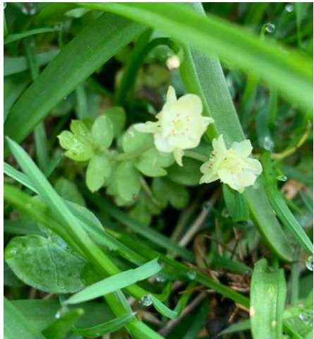
Town Hall Clock

Another of its common names is Town Hall Clock, so called because of the flowers that sit at the top of the stalk, four forming the (clock) faces of a cube and the fifth above.