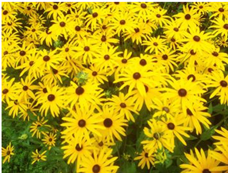
Rudbeckia Black-eyed Susan