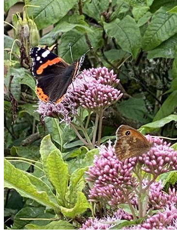
Red Admiral and Meadow Brown

Two of these species, the peacock and comma butterflies go into a state similar to hibernation as adults in sites such as on sheltered tree trunks, in hollow trees, woodpiles or the crevices of buildings. Probably our most common butterfly, the meadow brown overwinters as a caterpillar at the base of grasses and the red admiral generally and sensibly in my opinion, overwinters in the warmer climes of southern Europe and North Africa.