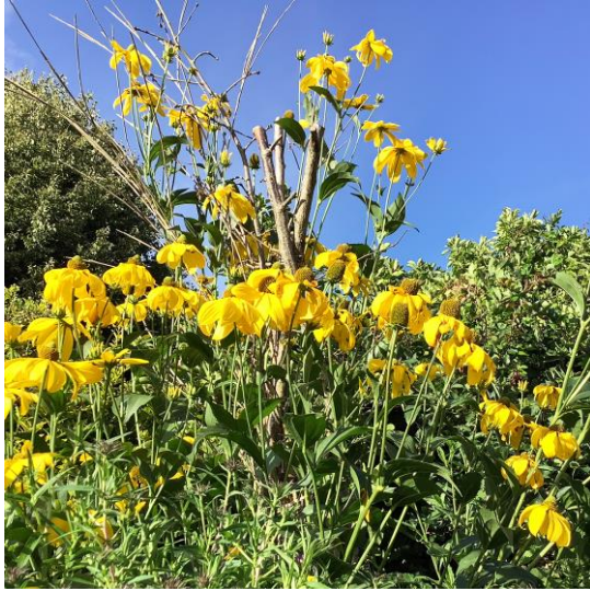
Rudbeckia lacinata Herbstsonne